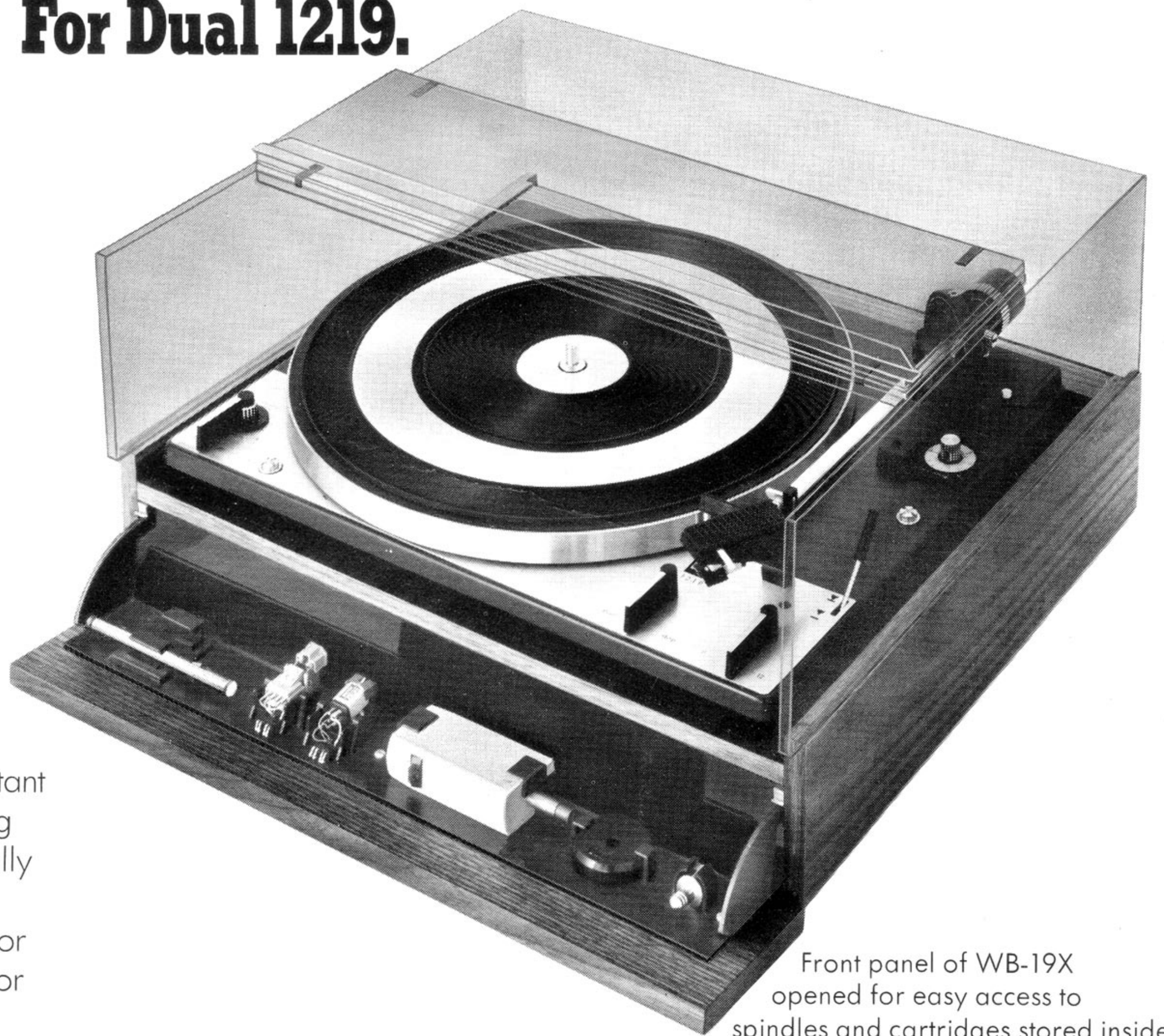
Front panel of WB-19X opened for easy access to spindles and cartridges stored inside.