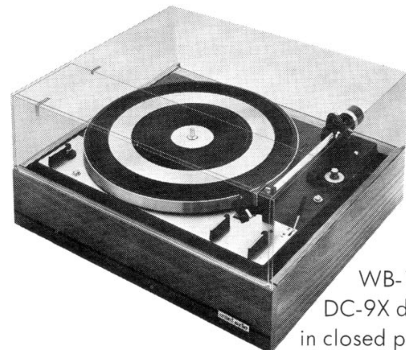
WB-19X base and DC-9X dust cover shown in closed positions.