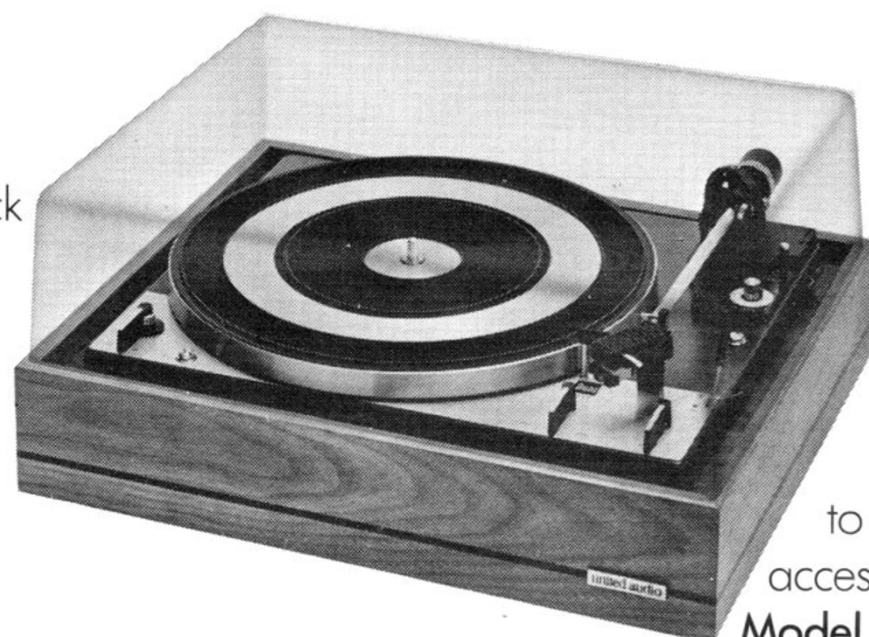
Walnut base, similar to WB-19X, but without accessory panel. Model WB-19, $14.95.